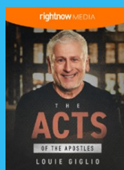
8-week study of Acts (Louie Giglio)

Did you know that you can use your free subscription to RightNow Media (available at no cost to everyone who participates in the life of our church family) to study practically any book of the Bible with guidance and engaging teaching from some of today’s most popular authors and preachers? Whether you prefer to study alone or with a group, these series Bible study resources allow you to dig into God’s Word with commentary and questions for reflection and discussion. Here are just a few of the series available: