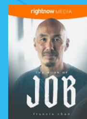
8-week study of Job (Francis Chan)